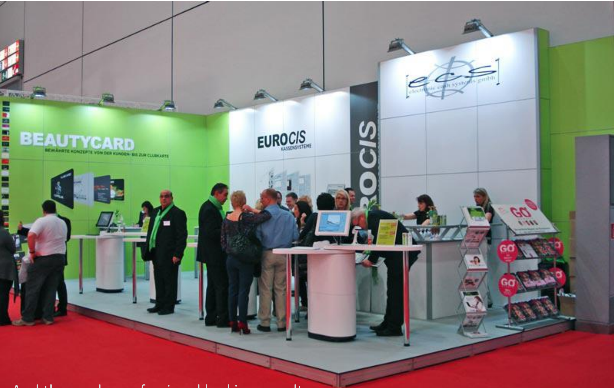
And the ready, professional looking, result.