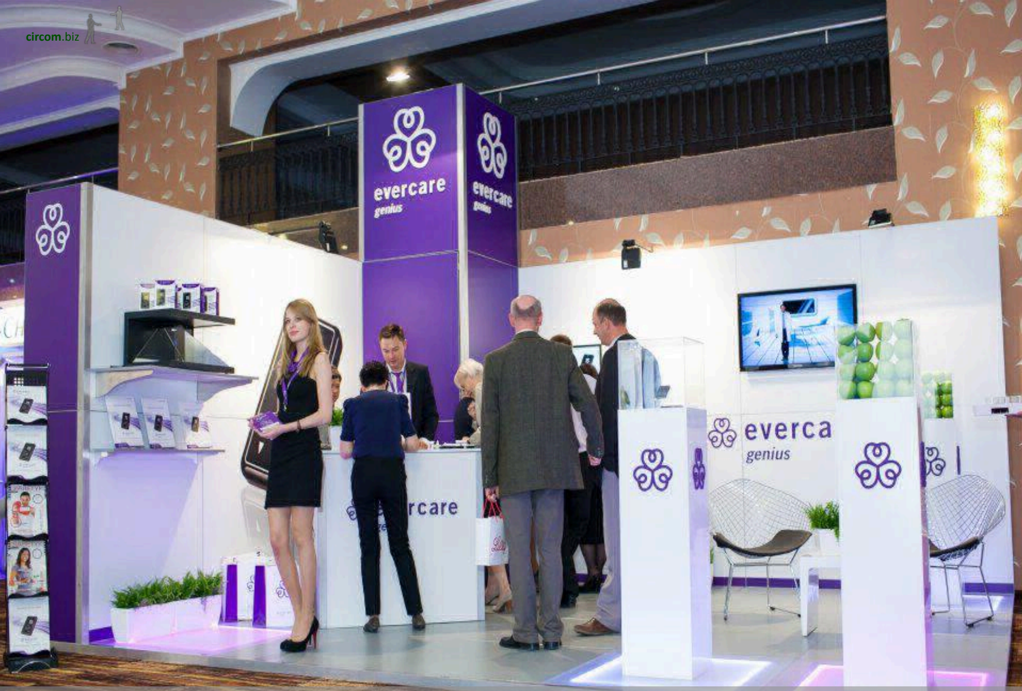
With shelving systems, monitor, cabine (advertising tower) and further more of helpfull details.