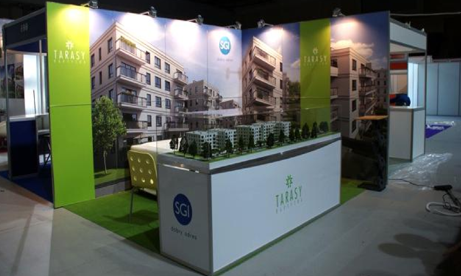
... Finished within 40 minutes, special designs (e.g. the counter board in XX length)