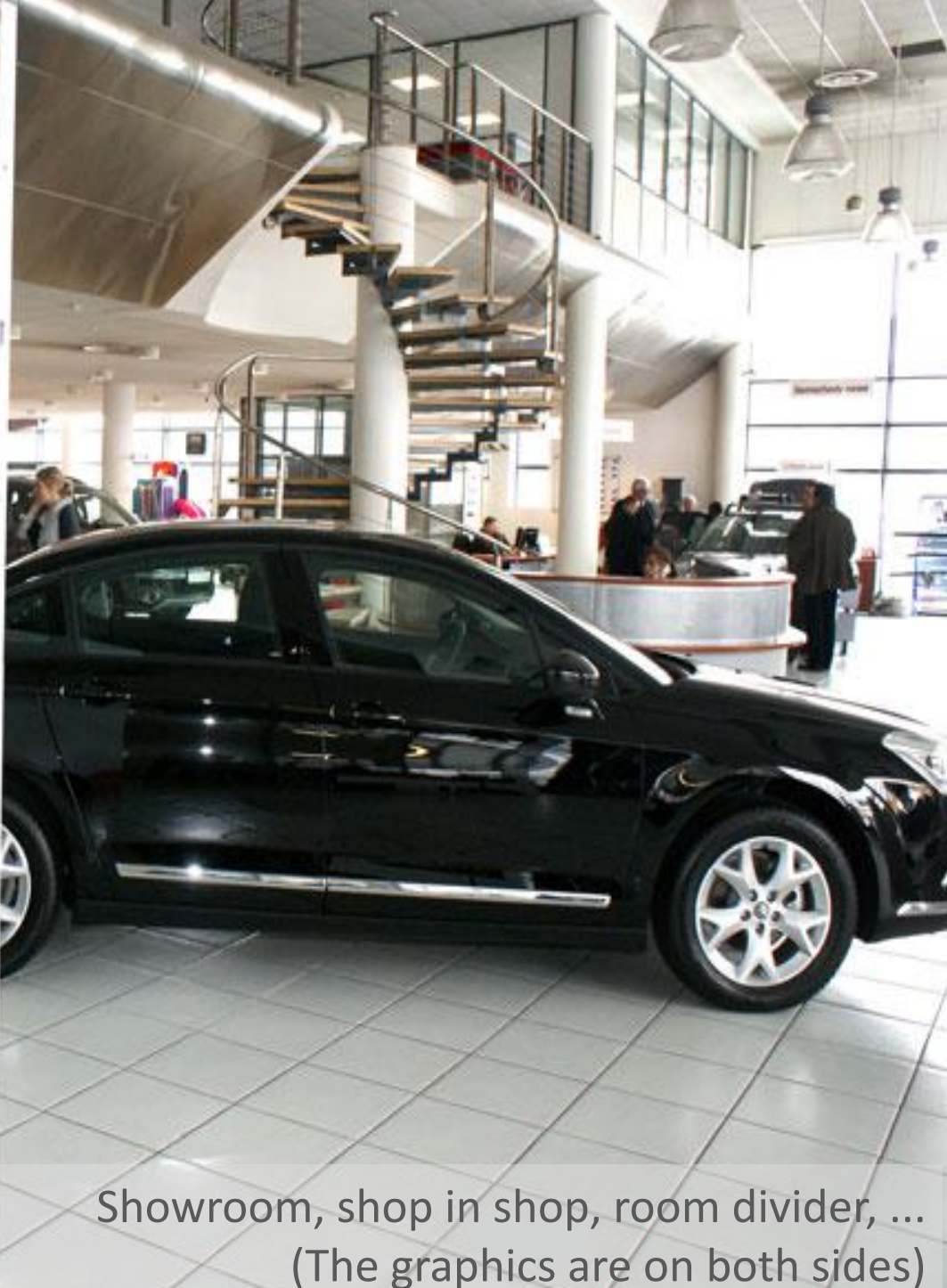
Showroom, shop in shop, room divider, ... (The graphics are on both sides)