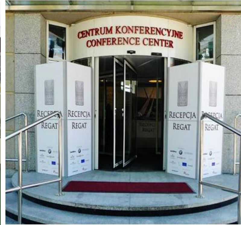
Use it for your event, road show, sponsoring, ... Indoor & Outdoor (tempory)